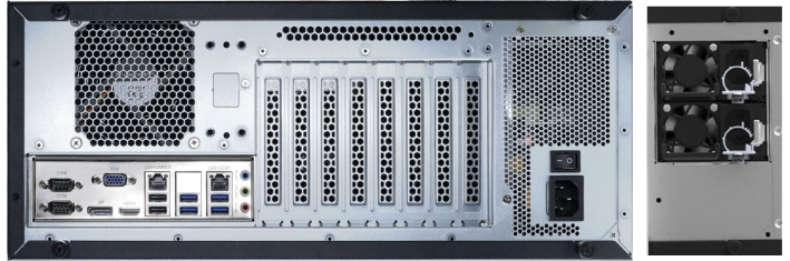
ATX PS2 standard power supply / CRPS redundant power supply*2 dual specifications, offering both user-friendly selection and professional reliability; rear window supports 9225 exhaust fan

*Specifications and information contained in this document are furnished for informational use only, and are subject to change at any time without notice, and should not be construed as a commitment by Decenta.